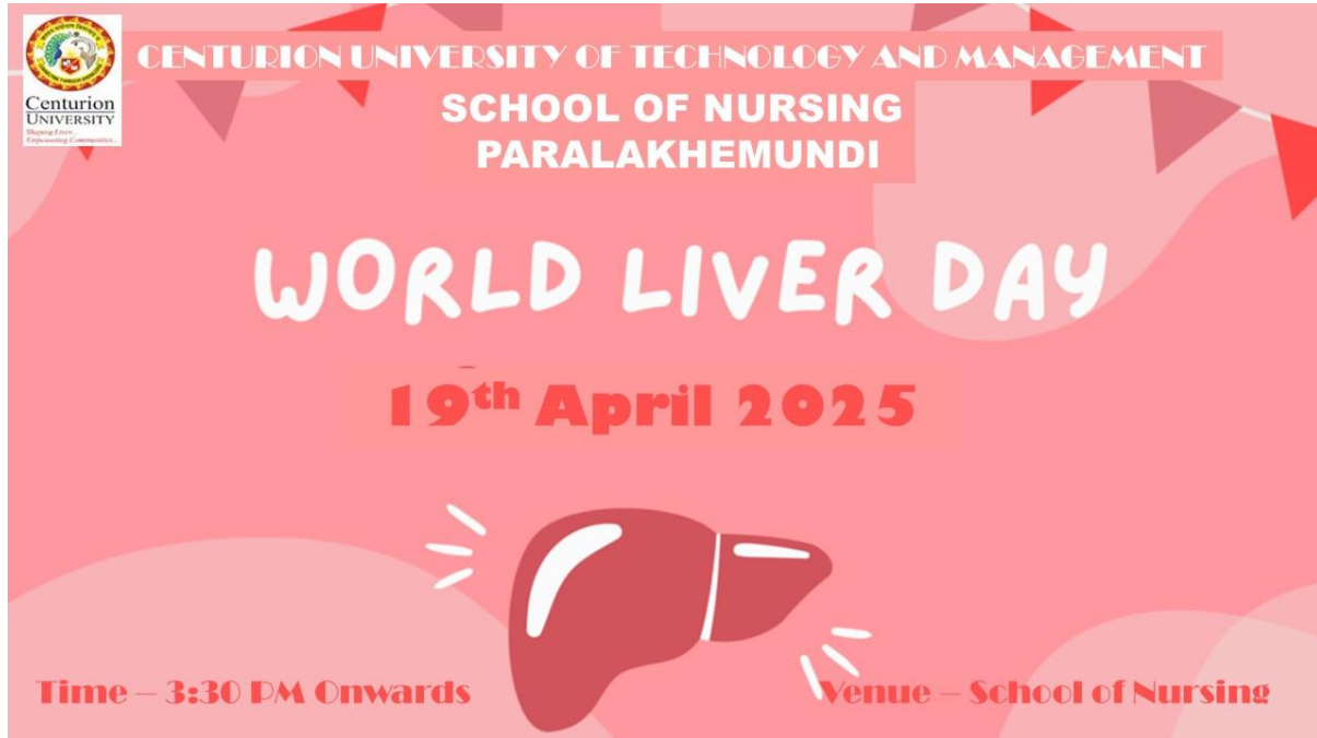
Banner for the event: World Liver Day at CUTM Paralakhemundi

Venue: School of Nursing, CUTM Campus, Paralakhemundi